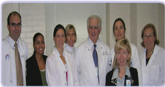
Members of Columbia University's SMA Interdisciplinary Team

Our mission is to provide comprehensive patient care, support research into the cause and cure for spinal muscular atrophy, educate tomorrow's health care professionals, and reach out to the community we serve.